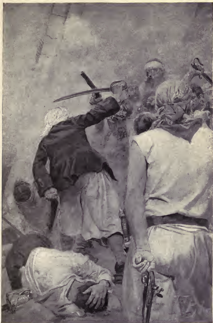
“THE COMBATANTS CUT AND SLASHED WITH SAVAGE FURY.”